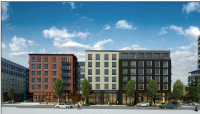
THE CARSON SOUTH