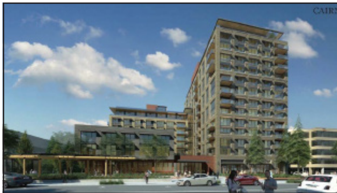
THE CARSON NORTH