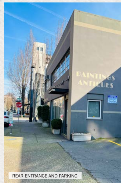
REAR ENTRANCE AND PARKING