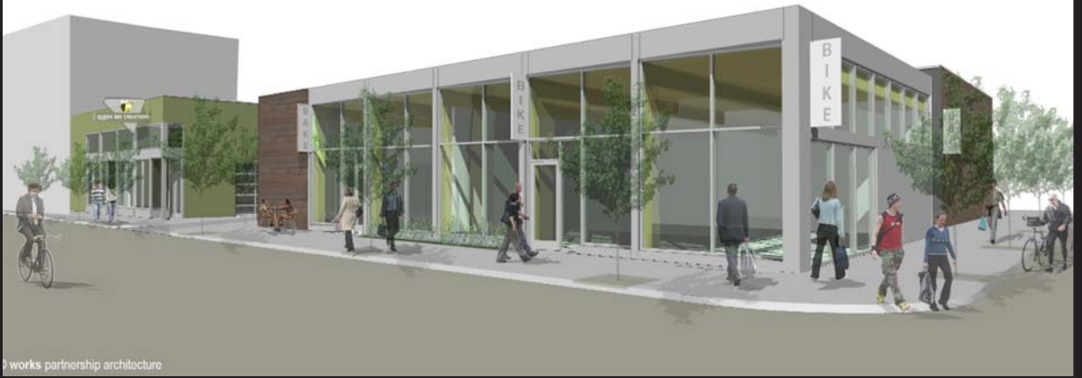
works partnership architecture